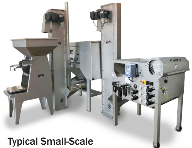
Typical Small-Scale Pecan Shelling Plant